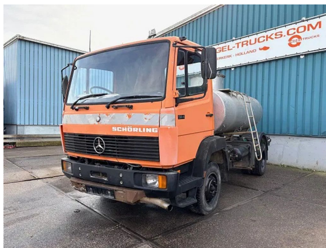
Mercedes-Benz LK 914KO RHD 4x2 FULL STEEL TANK TR...